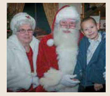
Holiday Open House